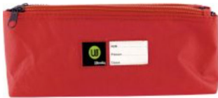
two pencil cases - one for coloured pencils and one for other supplies