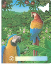
a parrot exercise book (can be bought at all the large stores; such as, Auchan, E.leclerc, Cactus)