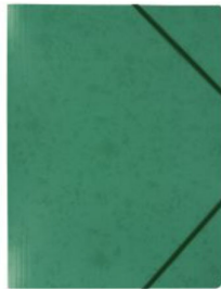
a RED and Green folder with elastic bands